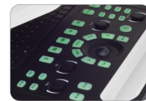
Backlight button, convenient to operate in darkroom