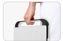
convenient to carry