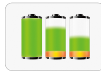
Independent battery compartment